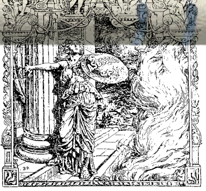
Lady Asbestos, from an early 20th-century advertising booklet

made with its fibers. Modeling clays and artificial snow contained asbestos. Hollywood even gave the mineral a couple of bit parts, in the Wicked Witch of the West's burning broomstick in The Wiz ard of Oz and the man-made spider webs that hung across the reanimated ancient Egyptian's cave in The Mummy .